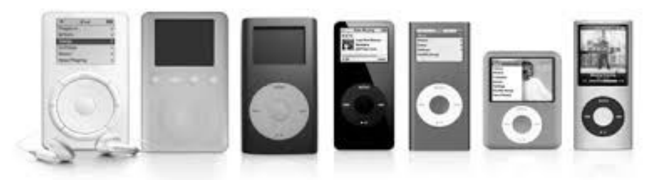
Apple iPod is a good example of a product that has experienced incremental changes over its lifespan

Slight changes that have occurred in products due to customer feedback or development in technology and thus improved the function of a product e.g. Dyson changing the method of suction to incorporate the cyclonic system which gave the cleaner extra suction power. The introduction of a waste container similar to a plastic bucket to collect the dust rather than using paper bags which would clog and thus reduce the efficiency of the machine.