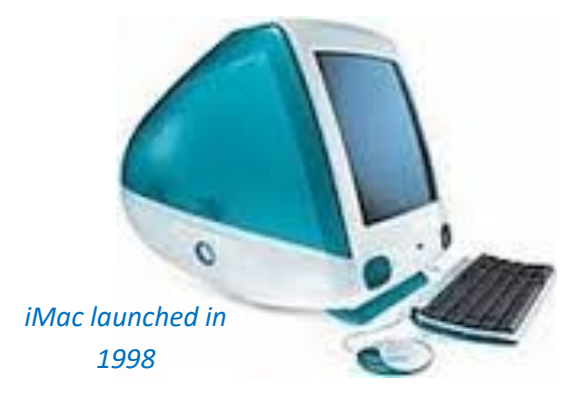
These products were extremely successful products when launched due to having Unique Selling Points