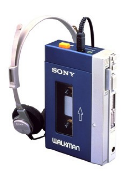
Sony Walkman launched in 1979

When launched the original iMac stood out from standard competitors due to its shape and how it differed from the existing computer. The Sony Walkman had Unique selling points when launched in 1979—no other portable personal cassette player was available on the market. The same can be said about the original Dyson vacuum cleaner - did not require a bag to collect the dust.